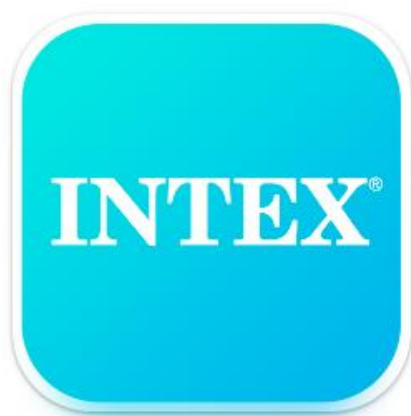
Old App Icon

Important: the panel must be fully loaded and protective foil must be removed from the screen of the panel before the pairing start.